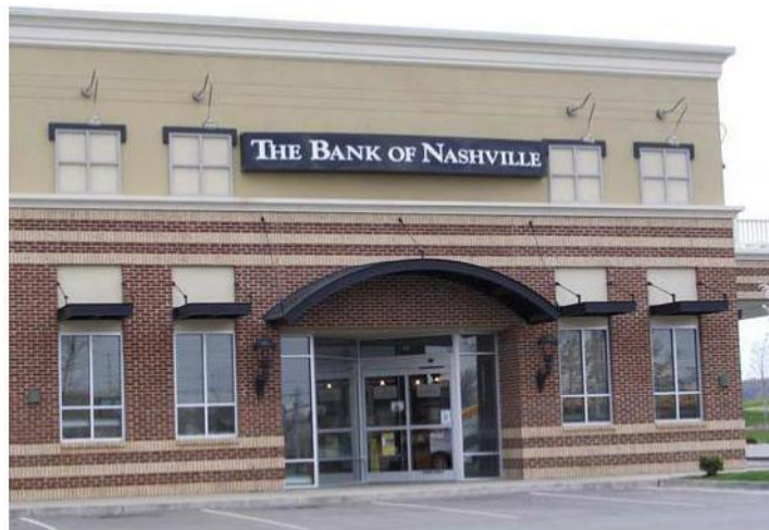
Example of copy and background as integrated unit