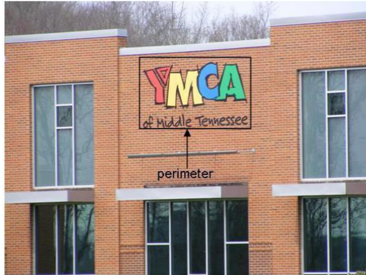
Example of copy without distinct background

single perimeter composed of one or more rectangles, circles, and/or triangles that enclose the extreme limits of the copy considered to be the sign.